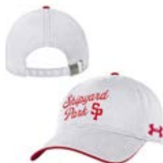
SHIPYARD PARK UH800W000

AEU03739541 CAP FP WH, MNY, RD AEU03318307 CAP CL MNY