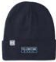
Halftime Beanie UH707U