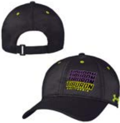
TIBURON, CA UH300M999 AEU03755010 CAP FPL CPU, FLY, BK AEU03318307 CAP CL FLY