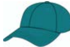
Womens Blitzing 3.0 Adjustable UH504W