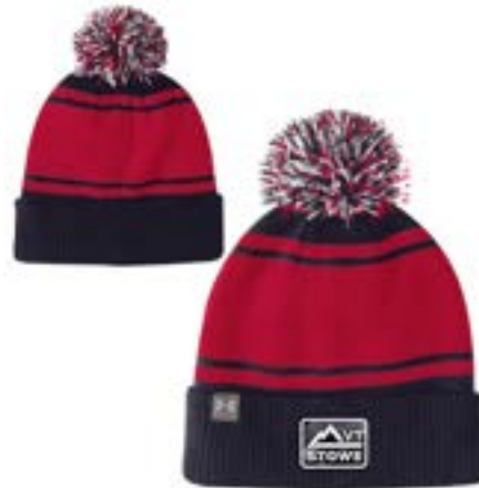
STOWE, VT UH706U999 AEU03754681 PTACP FP A-UBCC, BK, WH