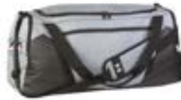
Undeniable MD Duffle UA1958