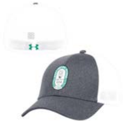
HUNTINGTON BEACH, CA UH505M917H AEU03805704 PPACP FP BG, BK, WH, CBT AEU03318307 CAP CL BG