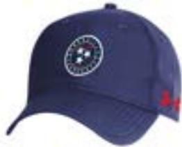
Performance 2.0 Adjustable Cap UH417M