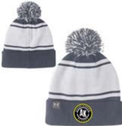
FAIRBANKS, AK UH706U9500 AEU03806762 PPACP FP WH, BK, FLY