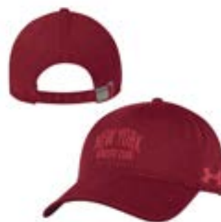
NEW YORK ATHLETIC CLUB UH800W539

AEU03805874 3DCP FP TG APU03805876 PC1 ELB BK AEU03318307 CAP CL BK