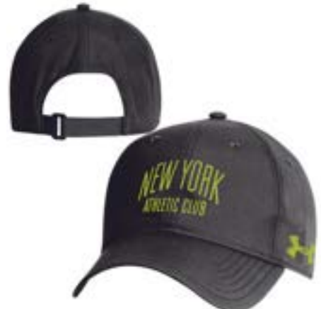
NEW YORK ATHLETIC CLUB UH417M999 AEU03754906 CAP FP VEL AEU03318307 CAP CL VEL