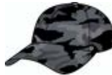
Youth Garment Washed Cotton Adjustable UH800Y