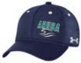
Youth Zone Adjustable UH300Y