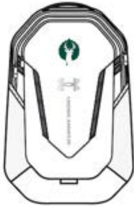
DEER VALLEY UA0528000 AEU03805855 E F HG