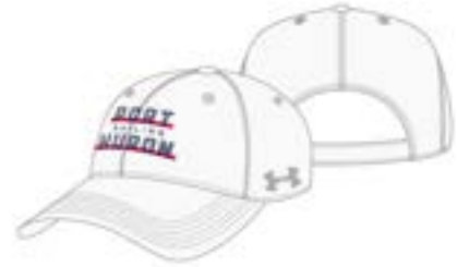
PORT HIRON UH417D000 AEU03451041 CAP FP MNY, TPK WATER