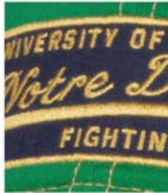
TWILL PATCH (TACP) THIS PROCESS METHOD UTILIZES A COMBINATION OF EMBROIDERY AND APPLIQUE FABRIC TO CREATE A GRAPHIC SEVERAL DIFFERENT FABRIC COLORS ARE AVAILABLE FOR USE, ONE APPLIQUE COLOR IS USED. SATIN STITCH TACK DOWN.