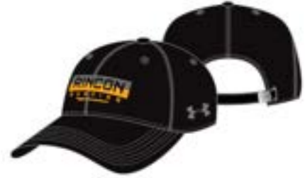
RINCON UH800D999 AEU03277971 CAP FP GF, MYW, BK WATER