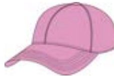
Womens Garment Washed Cotton Adjustable UH800W