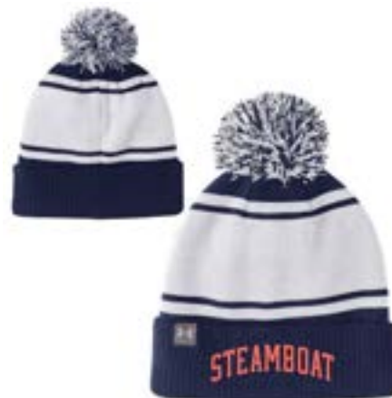
STEAMBOAT, CO UH706Y190 AEU03754958 3DCP FP FLT