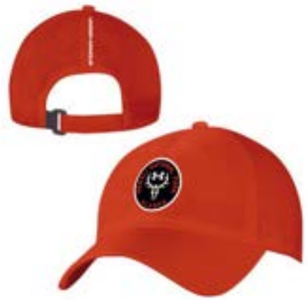
DENALI NATIONAL PARK UH627M455 AEU03809426 PACP FP CV, BK, RO AEU03332971 CAP VBT CV