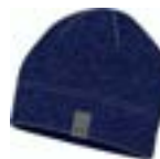
190 Midnight Navy