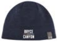
Storm Fleece Beanie UH775U