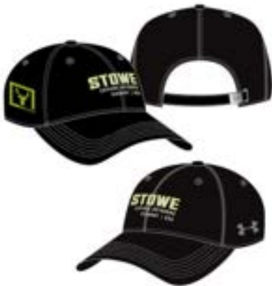
STOWE UH800D999 AEU03684483 CAP FP2 NBL, OAK ALPINE