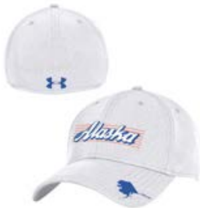
ALASKA UH628M000 AEU03809427 CAP FP PE, WH, DO AEU03809429 CAP CBL PE AEU03318307 CAP FCB PE