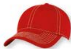
CONTRAST TOP STITCHING