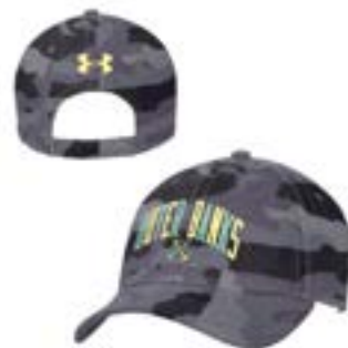
OUTER BANKS UH800Y99P

AEU03802886 CAP FP WH AEU03802887 CAP CB WH AEU03318307 CAP CL WH