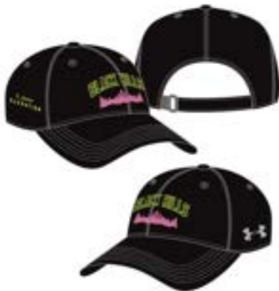
BLACK HILLS UH417D999 AEU03684477 CAP FP2 FUS. BK, VEL ALPINE