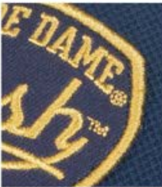
MERROWED EDGE PATCH (PTACP) TWILL PATCH WITH A MERROWED (RAISED EDGE)