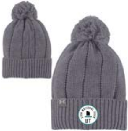
ZION NATIONAL PARK UH789W187H AEU03805697 PPACP FP SG, BK, WH