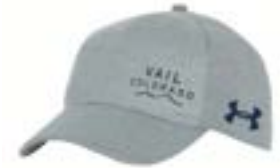
Womens Armour Adjustable UH209W