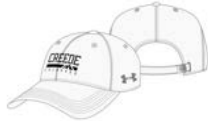
CREEDE UH800D000 AEU03684481 CAP FP BK ALPINE