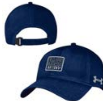
NASHVILLE, TN UH206Y19TW

AEU03809418 CAP LLP MNY AEU03318307 CAP CL MNY