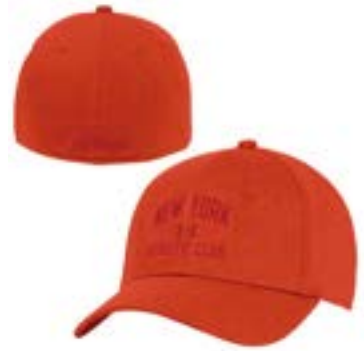
NEW YORK ATHLETIC CLUB UH503M455 AEU03760820 CAP FP RO, DAR AEU03332964 CAP FCB DAR