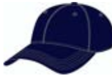
Mens Armour Adjustable UH209M