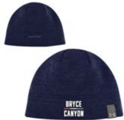
BRYCE CANYON UH775U190 AEU03805879 CAP FP BIT, TS, WH