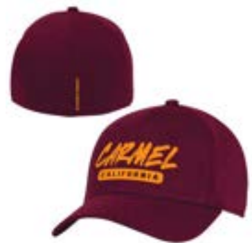
CARMEL-BY-THE-SEA UH503M580 AEU03760822 3DCP FP KA, RW AEU03332971 CAP VBT KA