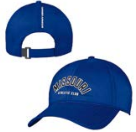
MISSOURI ATHLETIC CLUB UH300M148 AEU03754908 3DCP FP WH, BK AEU03332971 CAP VBT WH