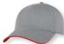
CONTRAST VISOR ROLL