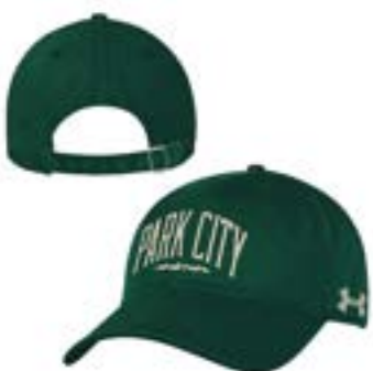
PARK CITY, UT UH800M292

AEU03805856 3DCP FP BK AEU03318307 CAP CL BK