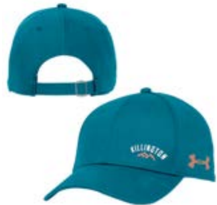
KILLINGTON, VT UH504W219 AEU03754929 CAP LLP WH, GAP AEU03318307 CAP CL GAP