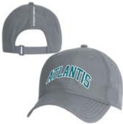
ATLANTIS, BS UH417M972 AEU03760812 CAP FP WH, FG AEU03332971 CAP VBT WH