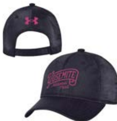
YOSEMITE NATIONAL PARK UH300Y999 AEU03684591 CAP FP POS AEU03318307 CAP CB POS