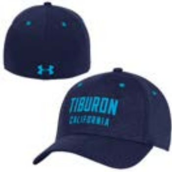
TIBURON, CA UH503M190 AEU03791770 3DCP FP CAB AEU03318307 CAP FCB CAB