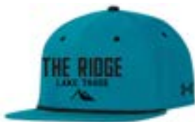
Mens Huddle UH551M