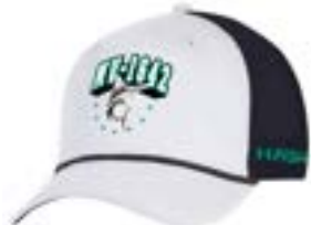
Mens Twist Armour 3.0 Trucker Snapback UH916M