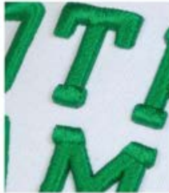
3D EMBROIDERY (3DCP) AN EMBROIDERY TECHNIQUE, WHICH USES FOAM TO CREATE A 3-DIMENSIONAL GRAPHIC