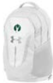
Hustle 6.0 Backpack UA0528