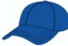
Womens Zone Adjustable UH300W