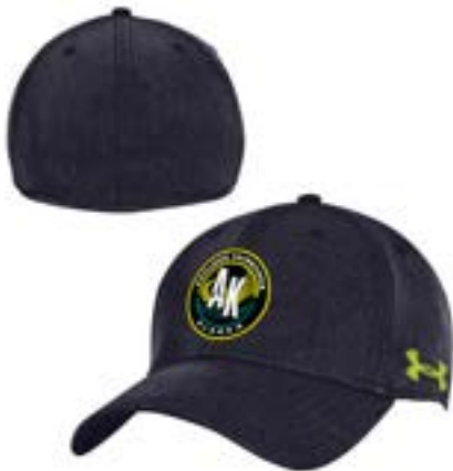
FAIRBANKS, AK UH628M999 AEU03805635 PACP FP BK, FLY, WH, FG AEU03318307 CAP CL FLY