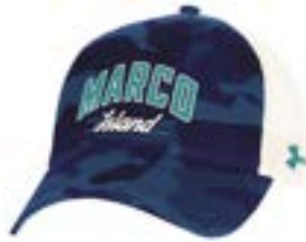
Mens Garment Washed Cotton Trucker Adjustable UH801M