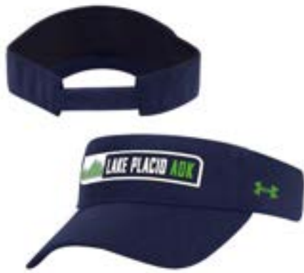
LAKE PLACID, ADK UH506M190 AEU03785346 CAP FP WH, FLG, TG, MNY AEU03318307 CAP CL FLG