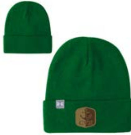
CHARLEVOIX, MI UH707U2045 AEU03809425 LACAP FP A-LET, CC