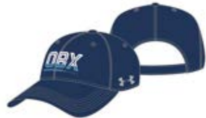
OBX UH417D1090 AEU03684476 CAP FP WH, BLH WATER