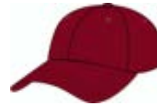
Youth Blitzing 3.0 Adjustable UH504Y