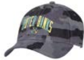
Youth Garment Washed Cotton Adjustable UH800Y