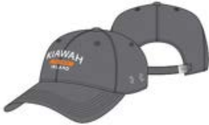
KIAWAH ISLAND UH800D972 AEU03462583 CAP FP WH, SPR, DGF WATER