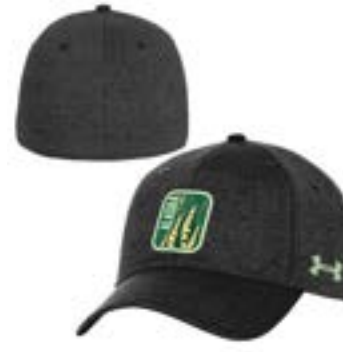
BRECKENRIDGE, CO UH206Y91TW

AEU03809432 CAP FP WSK, BTR AEU03318307 CAP CL BTR