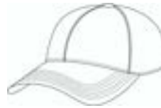
Womens Armour Adjustable UH209W