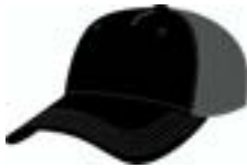
Mens Twist Armour 3.0 Trucker Snapback UH916M