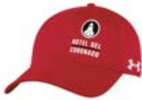
Mens Garment Washed Cotton Adjustable UH800M