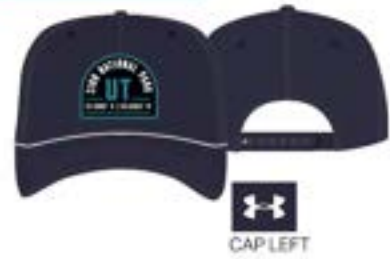
ZION NATIONAL PARK UH010M999 AEU03805707 PACP FP WH, BK, SG AEU03318307 CAP CL WH