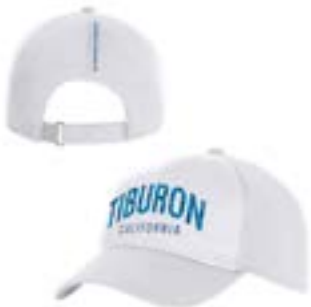
TIBURON, CA UH209W000

AEU03684736 CAP FP RSB, BYB, LR AEU03318307 CAP CL RSB ALPINE