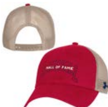
BASEBALL HALL OF FAME UH801M555

AEU03805714 CAP FP ST, DG AEU03318307 CAP CL ST