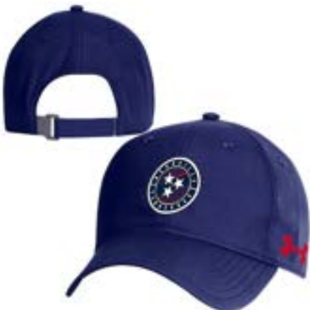
NASHVILLE, TN UH417M1090 AEU03805709 PACP FP WH, MNY, RD AEU03318307 CAP CL RD