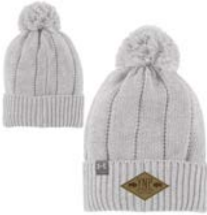
YELLOWSTONE NATIONAL PARK UH789W900H AEU03809422 LACAP FP A-LET, CC