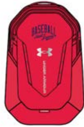
BASEBALL HALL OF FAME UA0528555 AEU03805776 E F MNY