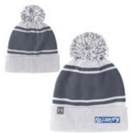
TELLURIDE, CO UH706U000 AEU03806763 PACP FPL PE, CV