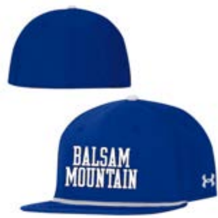
BALSAM MOUNTAIN UH551M148 AEU03786676 3DCP FP WH AEU03318307 CAP CL WH