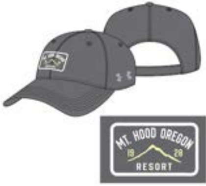
MT. HOOD UH417D972 AEU03183765 CAP FP WH, KC ALPINE