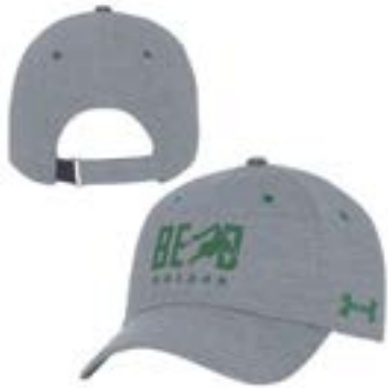
BEND, OR UH209M91TW

AEU03684474 TACP FP A-UWHW, RRD, MNY AEU03318307 CAP FCB MNY WATER