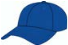
Mens Blitzing 3.0 Adjustable UH504M