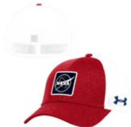
NASA UH505M5775 AEU03809521 PTACP FP A-UMNC, WH, MNY AEU03318307 CAP CL MNY