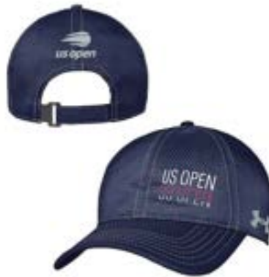
US OPEN UH300W190 AEU03805916 CAP FPL SI, POS, WH AEU03277493 CAP CB SI, MNY AEU03318307 CAP CL SI