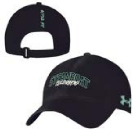
STEAMBOAT, CO UH627M999 AEU03805685 CAP FP SRF, WH, BK AEU03805690 CAP VBT SRF AEU03318307 CAP CB SRF