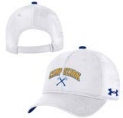
CAMP OZARK UH300Y000 AEU03809416 CAP FP GO, TBL, CHB AEU03318307 CAP CL TBL