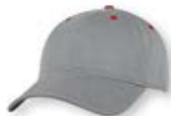
CONTRAST BUTTON & EYELETS