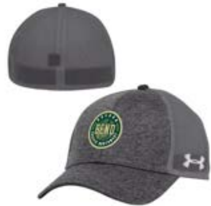
BEND, OR UH505M99H AEU03681641 PPACP FP CMT, TG, BK, DG, VGG, WH AEU03318307 CAP CL WH