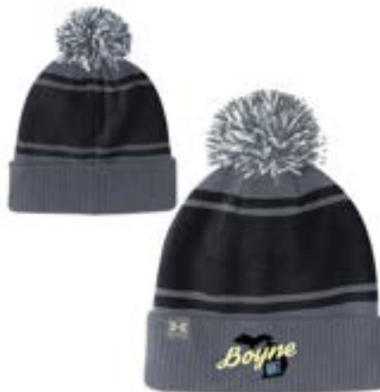
BOYNE MOUNTAIN RESORT UH706Y9500 AEU03809415 3DCTA FP A-UBKW, WAT, MNY, LC