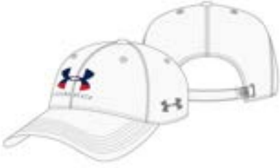
LAGUNA BEACH UH800D000 AEU03266965 CAP FP RD, MNY WATER