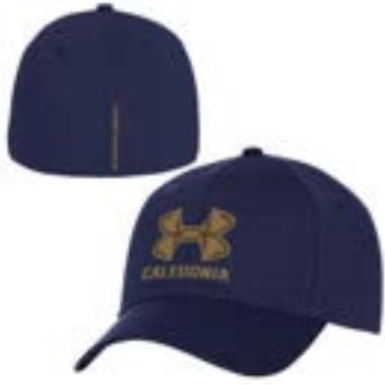
CALEDONIA, WI UH208M190

AEU03758202 LACAP FP A-LET, CC AEU03332971 CAP VBT CC