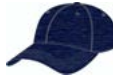
Youth Armour Adjustable UH206Y