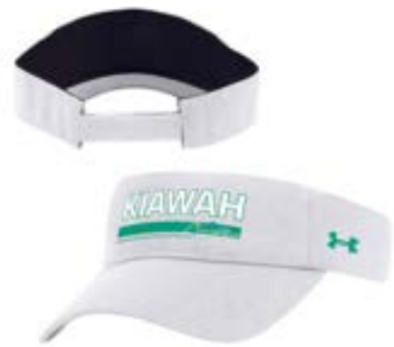
KIAWAH, SC UH506M000 AEU03805705 CAP FP BG, CBT, WH, KW, DBL AEU03318307 CAP CL BG