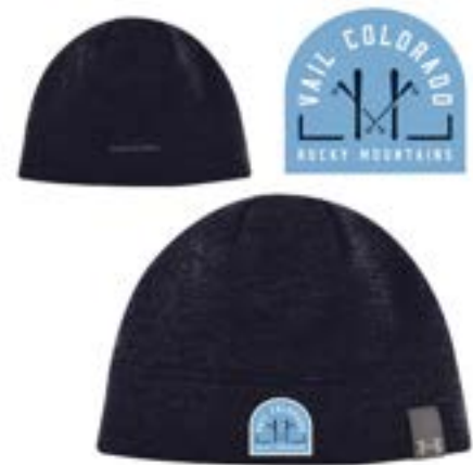
VAIL, CO UH775U999 AEU03805701 PACP FP WAT, WH, MNY