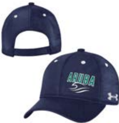
ARUBA UH300Y190 AEU03805920 CAP FPL WH, FG AEU03318307 CAP CL WH