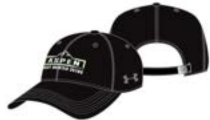
ASPEN UH800D999 AEU03684484 CAP FP MAR, WH ALPINE