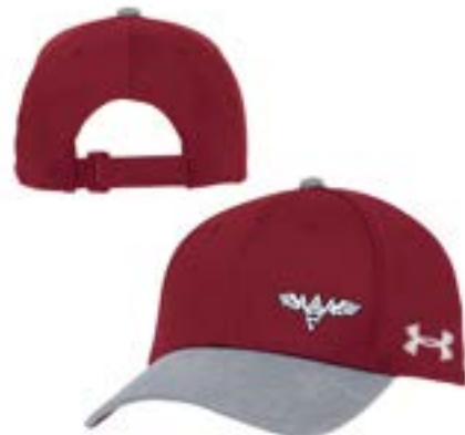
WASHINGTON ATHLETIC CLUB UH504Y539 AEU03805878 CAP LLP WH, MNY AEU03318307 CAP CL WH