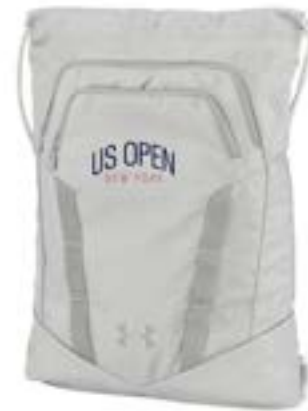
US OPEN UA19577402 AEU03805774 E F MNY, POS