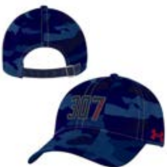
JACKSON HOLE, WY UH800M190P

AEU03805917 3DCP FP LC, SRF, BK AEU03318307 CAP CL LC