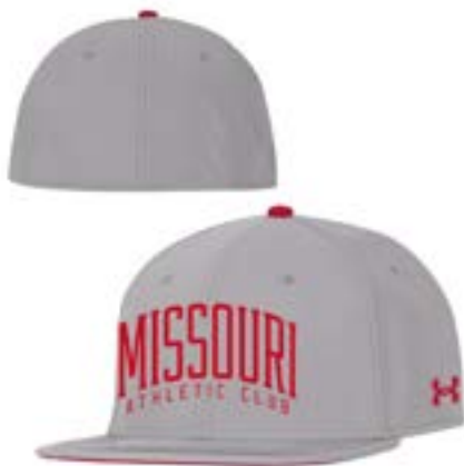
MISSOURI ATHLETIC CLUB UH551M938 AEU03684493 3DCP FP RD AEU03318307 CAP CL RD