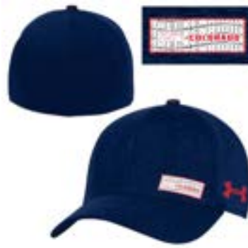
BRECKENRIDGE, CO UH503M19H AEU03681760 PACP LLP WH, FRR, MNY AEU03318307 CAP CL FRR