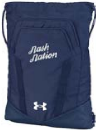
NASHVILLE - SPORT UA1957190 AEU03805459 E F NIK