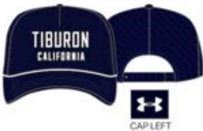
TIBURON, CA UH010M190 AEU03791770 3DCP FP WH AEU03318307 CAP CL WH