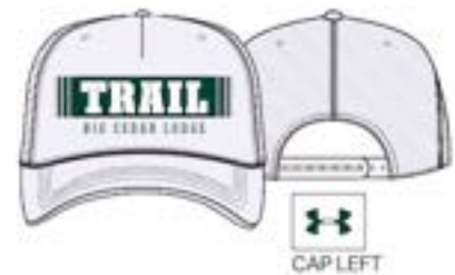
BIG CEDAR LODGE UH010M000 AEU03809505 3DCP FP DG, WH AEU03318307 CAP CL DG