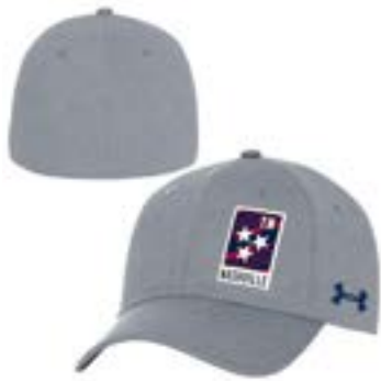
NASHVILLE, TN UH208M91TW

AEU03758202 LACAP FP A-LET, CC AEU03332971 CAP VBT CC