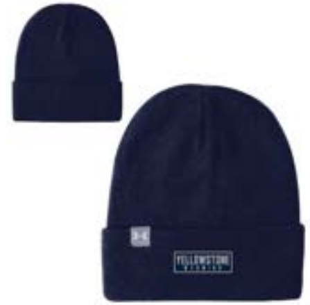
YELLOWSTONE NATIONAL PARK UH707U190 AEU03802888 PACP FP TG, MNY