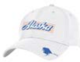
Mens ArmourVent™ Stretch Fit UH628M