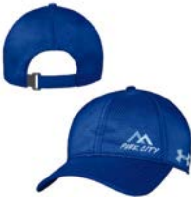
PARK CITY, UT UH300W148 AEU03805694 CAP LLP ICE, WAT AEU03318307 CAP CL ICE