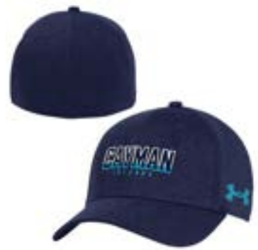
CAYMAN ISLANDS UH503M190 AEU03806492 3DCP FP MNY, WH, LTQ AEU03318307 CAP CL LTQ