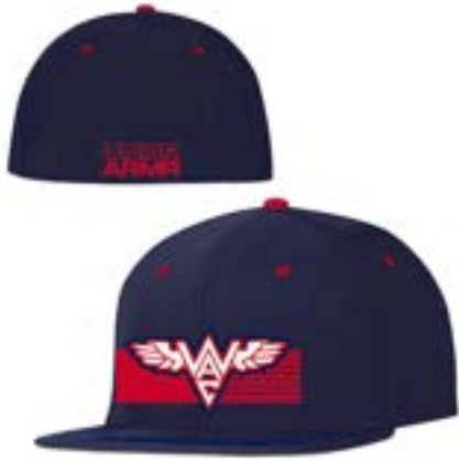
WASHINGTON ATHLETIC CLUB UH551M190 AEU03809522 3DCP FP RD, WH, MNY AEU03332964 CAP FCB RD