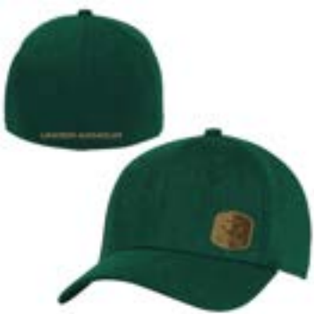
CHARLEVOIX, MI UH503M292 AEU03809425 LACAP LLP A-LET, CC AEU03332965 CAP FCB CC