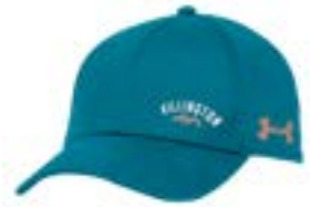
Womens Blitzing 3.0 Adjustable UH504W