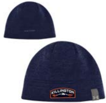
KILLINGTON UH775U190 9500 AEU03684698 PACP FP LO, WH, MNY ALPINE