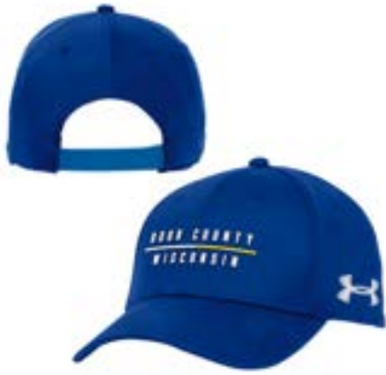
DOOR COUNTY, WI UH504M148 AEU03805869 CAP FP FLY, WH AEU03318307 CAP CL WH