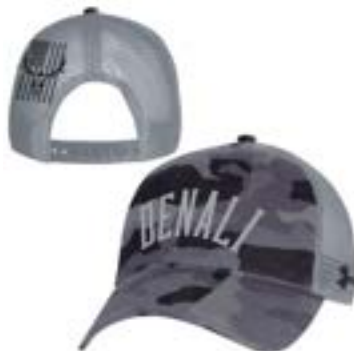
DENALI NATIONAL PARK UH801M99P

AEU03809463 TACP FP A-UNYW, WH, FWR AEU03318307 CAP CL FWR