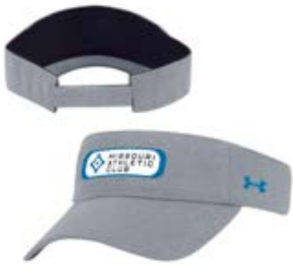
MISSOURI ATHLETIC CLUB UH506M91H AEU03681796 PACP FP WH, CDT, BK AEU03318307 CAP CL CDT SPORT