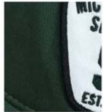
3D TWILL PATCH (3DCTA) 3D ELEMENTS INCORPORATED ONTO TWILL OR WOOL PATCH. MAY BE FULL LOGO OR PATCH SHAPE. 3D TACKDOWN CAN BE OPTIONAL.