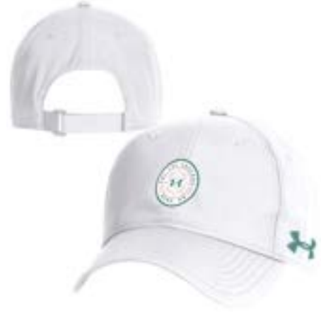
BEND, OR UH417M000 AEU03754917 PACP FP WH, RO, BAS AEU03318307 CAP CL BAS