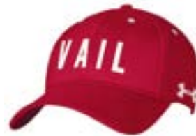
Mens Zone Stretch Fit UH310M