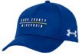
Mens Blitzing 3.0 Adjustable UH504M