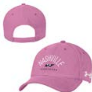
NASHVILLE, TN UH800Y5111

AEU03809419 3DCP FP RD, WH AEU03318307 CAP CL RD