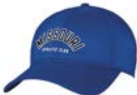
Mens Zone Adjustable UH300M