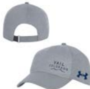
VAIL, CO UH209W91TW

AEU03805651 3DCP FP WH APU03805650 NZCP1 FP KLR, RY AEU03332971 CAP VBT RY