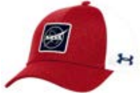
Mens Blitzing 3.0 Spacer Mesh Stretch Fit UH505M