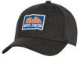
Mens Blitzing 3.0 Stretch Fit UH503M