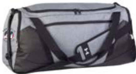
ANNAPOLIS YACHT CLUB UA1958917H AEU03805743 E F FWR, WIN, WH