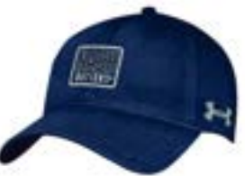
Youth Armour Adjustable UH206Y