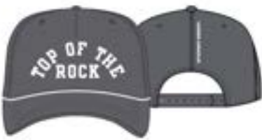
TOP OF THE ROCK UH010M972 AEU03691525 3DCP FP WH AEU03332971 CAP VBT WH