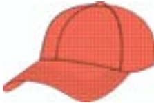
Mens ArmourVent™ Adjustable UH627M