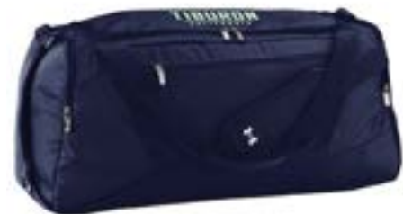
TIBURON, CA UA1958190 AEU03805636 E T PLG