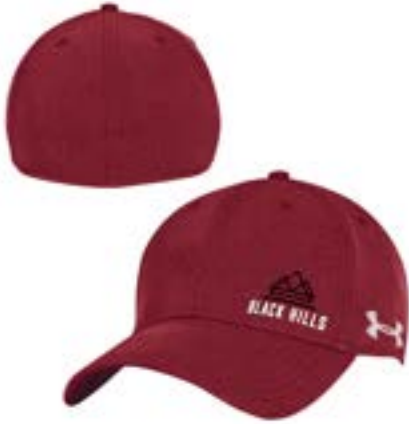
BLACK HILLS, SD UH628M539 AEU03805634 CAP LLP WH, BK AEU03318307 CAP CL WH