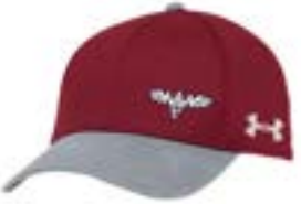
Youth Blitzing 3.0 Adjustable UH504Y