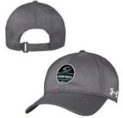
LAGUNA BEACH, CA UH300W972 AEU03805649 TACP FP A-UBKC, BK, WH, BG AEU03318307 CAP CL WH