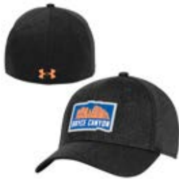
BRYCE CANYON UH503M99H AEU03809510 3DCTA FP A-URYC, BIT, WH, TS, TBL AEU03318307 CAP FCB BIT