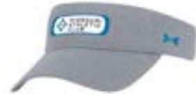
Blitzing 3.0 Visor UH506M