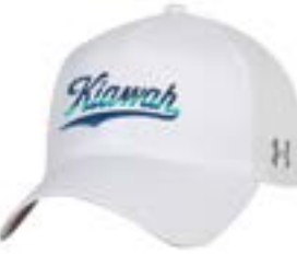
Domestic Performance 2.0 Adjustable Cap UH417D