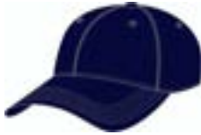
Mens Zone Stretch Fit UH310M