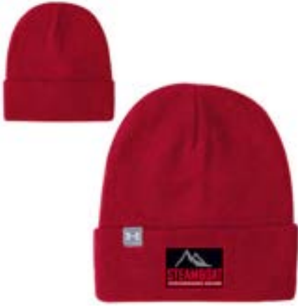
STEAMBOAT, CO UH707U555 AEU03754960 PACP FP WH, BK, NIK, RD