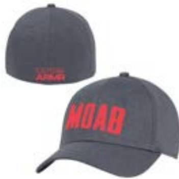
MOAB, UT UH503M917H AEU03731204 3DCP FP BRD AEU03332964 CAP FCB BRD