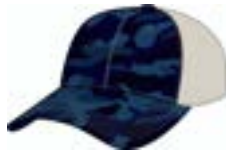
Mens Garment Washed Cotton Trucker Adjustable UH801M