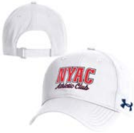
NEW YORK ATHLETIC CLUB UH417M000 AEU03809454 3DCP FP FRR, WH, MNY AEU03318307 CAP CL MNY