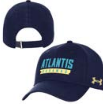
ATLANTIS, BS UH209M190

AEU03684510 3DCP FP BKG AEU03318307 CAP CL BKG