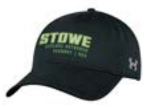
Domestic Garment Washed Cotton Adjustable UH800D