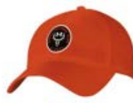
Mens ArmourVent™ Adjustable UH627M