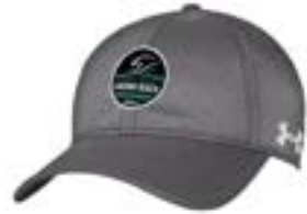
Womens Zone Adjustable UH300W