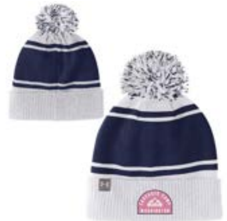
CASCADES CAMP UH706Y000 AEU03806744 PACP FP WH, PMS-507 C, MNY