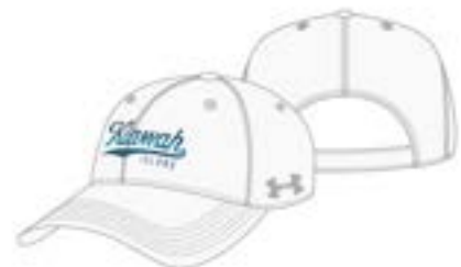
KIAWAH ISLAND UH417D000 AEU03684479 CAP FP TUR, WIN, LR WATER