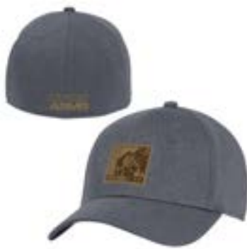
TELLURIDE, CO UH503M917H AEU03681799 LACAP FP A-LET, CC AEU03332964 CAP FCB CC