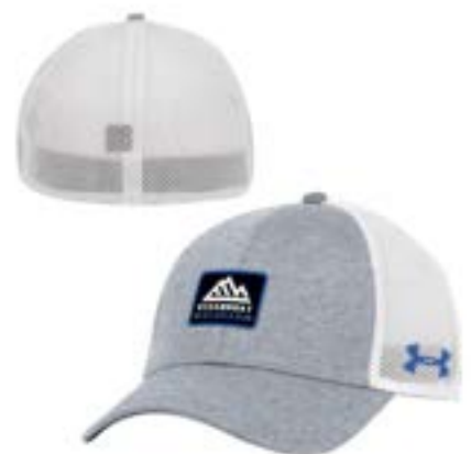
STEAMBOAT, CO UH505M91H AEU03754910 PPACP FP WH, PE, CK, BK AEU03318307 CAP CL PE