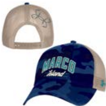
MARCO ISLAND, FL UH801M190P

AEU03805858 CAP FPL WH, BK AEU03318307 CAP CL WH