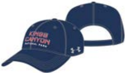
KINGS CANYON UH417D1090 AEU03484013 CAP FP WH, RD, MNY ALPINE