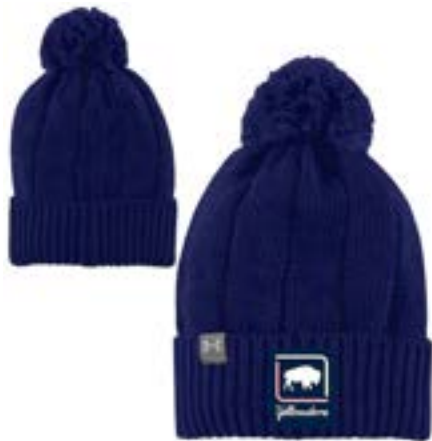
YELLOWSTONE NATIONAL PARK UH789W1090 AEU03809423 PPACP FP MNY, WH, CMB