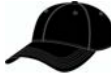
Youth Zone Adjustable UH300Y