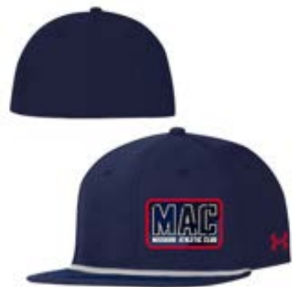
MISSOURI ATHLETIC CLUB UH551M190 AEU03756727 3DCTA FPL A-UNCC, RD, WH AEU03318307 CAP CL RD