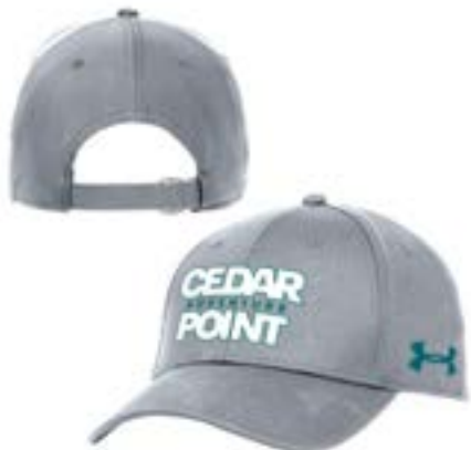
CEDAR POINT UH504W91H AEU03805638 3DCP FP WH, FG AEU03318307 CAP CL FG