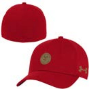
SONTERRA TENNIS CLUB UH503M5775 AEU03754926 LACAP FP A-LET, CC AEU03318307 CAP CL CC