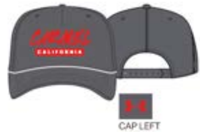
CARMEL-BY-THE-SEA UH010M972 AEU03760822 3DCP FP WH, FLR AEU03318307 CAP CL FLR