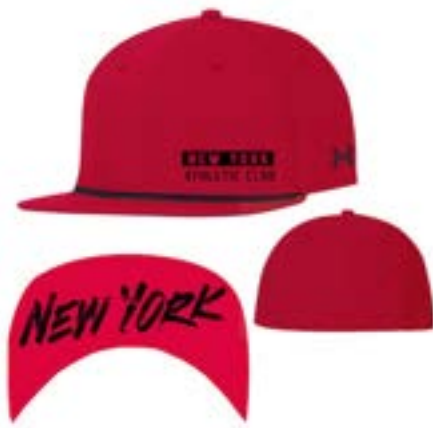
NEW YORK ATHLETIC CLUB UH551M555 AEU03754975 CAP LLP BK, RD APU03754994 NZCP1 EUV BK, SCR AEU03318307 CAP CL BK