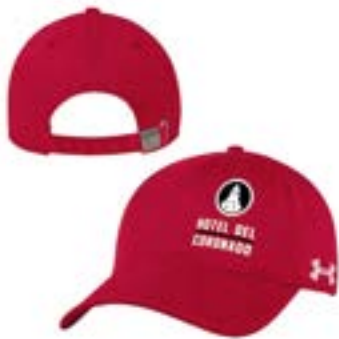
HOTEL DEL CORONADO UH800M555

AEU03805858 CAP FPL WH, BK AEU03318307 CAP CL WH