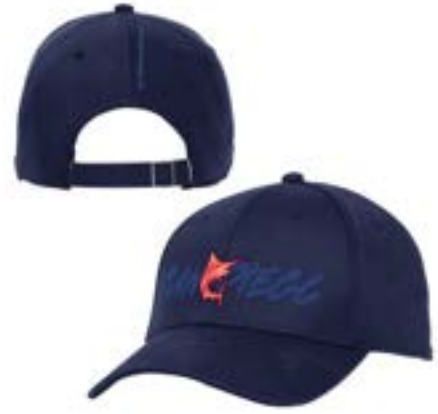
SAN DIEGO, CA UH504M19H AEU03809518 PPACP FP FRR, MNY, AB, CFL AEU03332971 CAP VBT AB