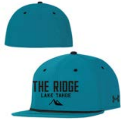
THE RIDGE, LAKE TAHOE UH551M219 AEU03809515 3DCP FP BK AEU03318307 CAP CL BK