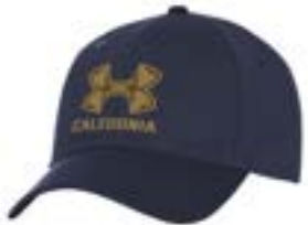
Mens Armour Cap Stretch Fit UH208M