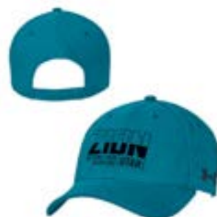
ZION NATIONAL PARK UH800Y219

AEU03754906 CAP FP CCO AEU03318307 CAP CL CCO