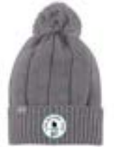
Womens Everyday POM Beanie UH789W