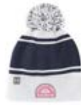
Youth POM Beanie UH706Y