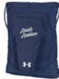
Undeniable Sackpack UA1957