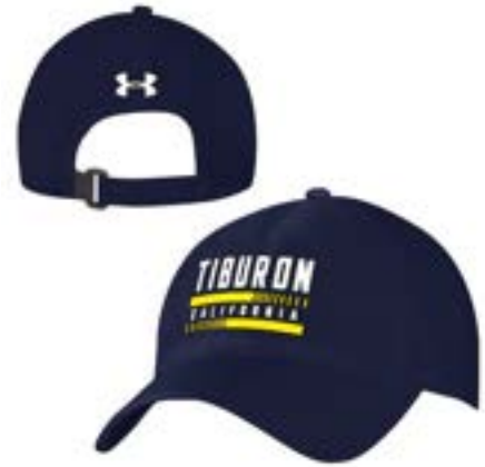
TIBURON UH627M190 455 AEU03684506 CAP FP WH, FLY AEU03318307 CAP CB WH WATER