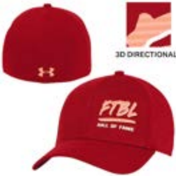
FOOTBALL HALL OF FAME UH503M5775 AEU03805918 3DCP FPL CFL, CV AEU03318307 CAP FCB CFL