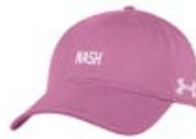
Womens Garment Washed Cotton Adjustable UH800W