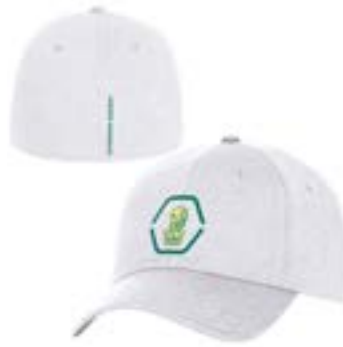
RITZ-CARLTON SAN FRANCISCO UH208M000

AEU03805702 PACP FPL RD, MNY, WH AEU03318307 CAP CL MNY