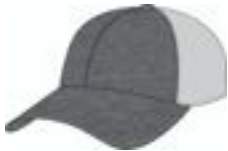
Mens Blitzing 3.0 Spacer Mesh Stretch Fit UH505M