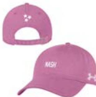
NASHVILLE, TN UH800W5111

AEU03805871 3DCP FP SG, WH APU03805657 PC1 ERB WSP AEU03318307 CAP CL SG