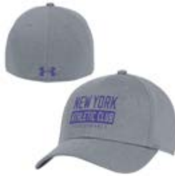
NEW YORK ATHLETIC CLUB UH503M91H AEU03754946 CAP FP LP, SI AEU03318307 CAP FCB LP