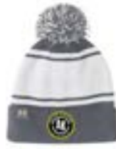
POM Beanie UH706U