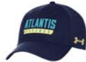
Mens Armour Adjustable UH209M