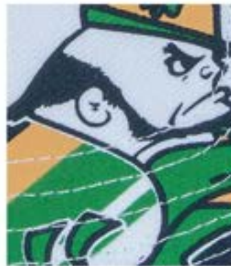
SCREEN PRINT (PC1) SCREEN PRINT - ONE COLOR ALLOWED ON HUDDLE AND COTTON TWILL FABRIC.