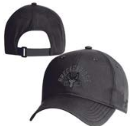
BRECKENRIDGE, CO UH417M999 AEU03684513 CAP FP DGF AEU03318307 CAP CL DGF