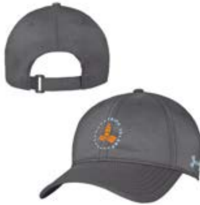
FRIPP ISLAND, SC UH300M972 AEU03805861 CAP FP ICE, SUN AEU03318307 CAP CL ICE