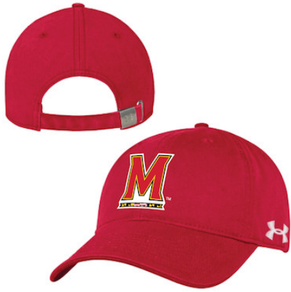
UNIVERSITY OF MARYLAND UH800M555 AEU03791501 PTACP FP A-UWHW, RD, PAR, BK, BK AEU03318307 CAP CL WH