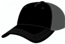
Mens Twist Armour 3.0 Trucker Snapback UH916M