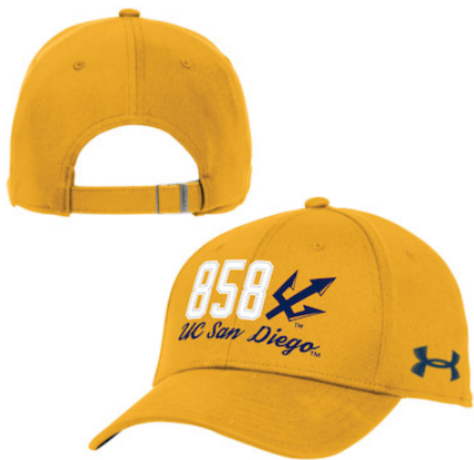
UNIVERSITY OF CALIFORNIA, SAN DIEGO UH504M307 AEU03790630 TACP FP A-UWHW, MNY, MYW AEU03318307 CAP CL MNY