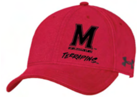
Youth Garment Washed Cotton Adj. UH800Y