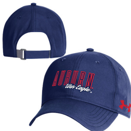
AUBURN UNIVERSITY UH417M1090 AEU03787306 CAP FP WH, MNY, RO AEU03318307 CAP CL RO