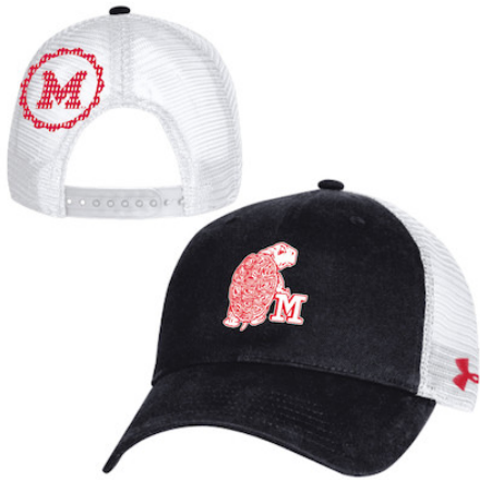
UNIVERSITY OF MARYLAND UH801M999 AEU03782337 CAP FP RD, WH APU03782365 PC1 ELB SCR AEU03318307 CAP CL RD