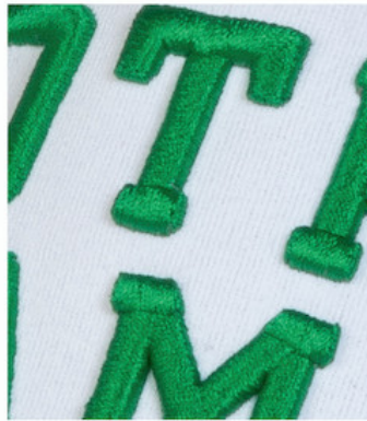
3D EMBROIDERY (3DCP) AN EMBROIDERY TECHNIQUE, WHICH USES FOAM TO CREATE A 3-DIMENSIONAL GRAPHIC