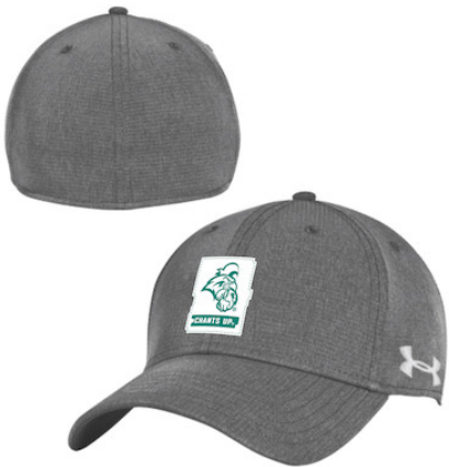
COASTAL CAROLINA UNIVERSITY UH628M972 AEU03790629 PTACP FP A-UWHW, FG, WH AEU03318307 CAP CL WH