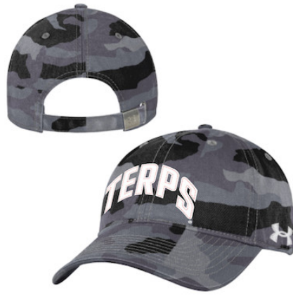
UNIVERSITY OF MARYLAND UH800M99P AEU03787333 TACP FP A-UWHW, RD AEU03318307 CAP CL WH