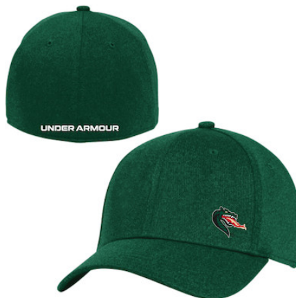
THE UNIVERSITY OF ALABAMA AT BIRMINGHAM UH503M292 AEU03779682 CAP LLP WH, DG, BK, RD, NGO AEU03332965 CAP FCB WH