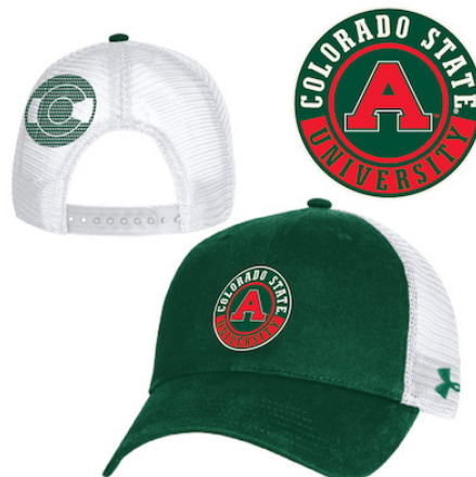
COLORADO STATE UNIVERSITY UH801M292 AEU03784511 PPACP FP CV, DG, RO APU03615820 PC1 ELB DG AEU03318307 CAP CL DG