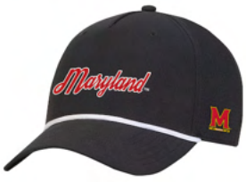
Mens Driver Snapback with Rope UH010M