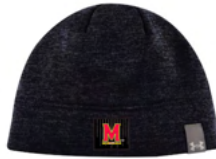
Storm Fleece Beanie UH775U