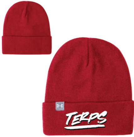
UNIVERSITY OF MARYLAND UH707U555 AEU03787287 3DCP FP WH, BK