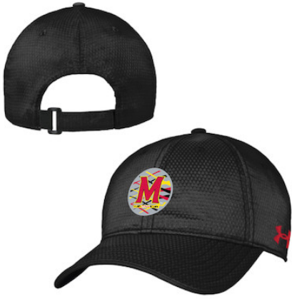
UNIVERSITY OF MARYLAND UH300M999 AEU03792603 PPACP FP RD, BK, WH, PAR, TG AEU03318307 CAP CL RD