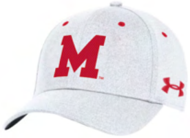
Mens Blitzing 3.0 Stretch Fit UH503M