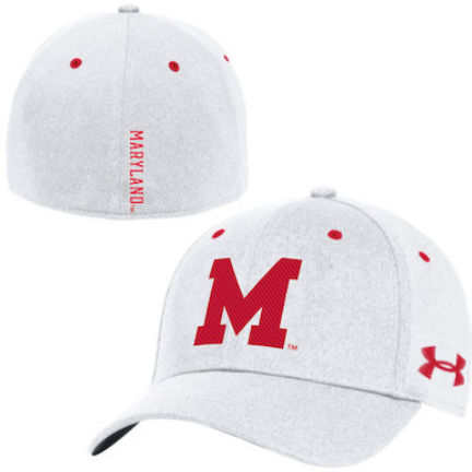
UNIVERSITY OF MARYLAND UH503M000 AEU03779685 3DCP FP RD AEU03782363 CAP VBT RD AEU03318307 CAP CL RD