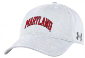
Domestic Garment Washed Cotton Adj. UH800D