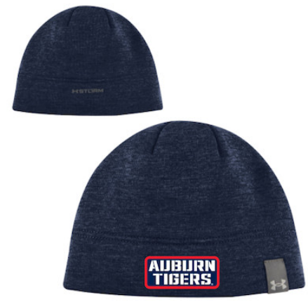
AUBURN UNIVERSITY UH775U190 AEU03766172 3DCP FP RO, MNY, WH