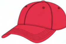
Mens Zone Stretch Fit UH310M