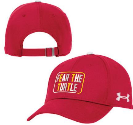
UNIVERSITY OF MARYLAND UH504W555 AEU03787338 CAP FP WH, DS, PAR AEU03318307 CAP CL WH