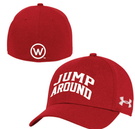
UNIVERSITY OF WISCONSIN MADISON UH503M5775 AEU03762098 3DCP FP WH AEU03384718 CAP FCB WH AEU03318307 CAP CL WH