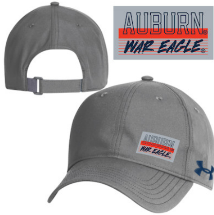
AUBURN UNIVERSITY UH417M972 AEU03787305 PPACP LLP TG, MNY, RO AEU03318307 CAP CL MNY