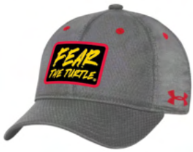
Youth Zone Adjustable UH300Y