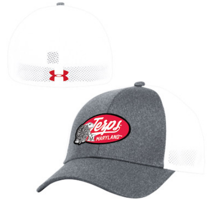
UNIVERSITY OF MARYLAND UH505M917H AEU03784781 PPACP FP RD, BK, WH AEU03318307 CAP FCB RD