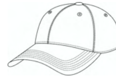
Youth Armour Adjustable UH206Y