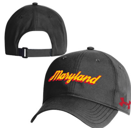
UNIVERSITY OF MARYLAND UH417M999 AEU03792998 3DCP FP PAR, RD AEU03318307 CAP CL RD