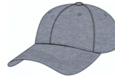
Youth Blitzing 3.0 Adjustable UH504Y