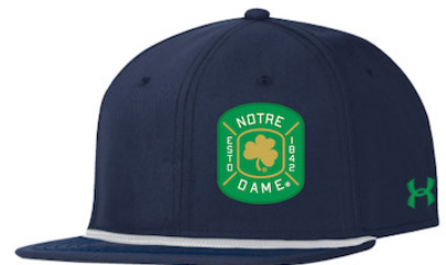
UNIVERSITY OF NOTRE DAME UH551M190 AEU03790633 PPACP FP GR, WH, GDR AEU03318307 CAP CL GR