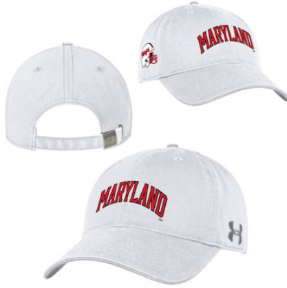
UNIVERSITY OF MARYLAND UH800D000 AEU03782339 CAP FP2 RD, BK, WH