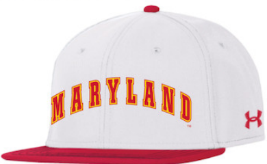
UNIVERSITY OF MARYLAND UH551M000 AEU03792601 CAP FP RD, PAR AEU03660196 CAP FCB RD, PAR, WH, BK AEU03318307 CAP CL RD