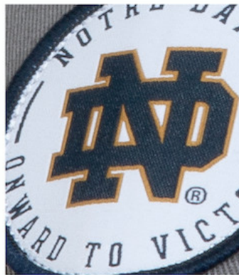
WOVEN PATCH (PACP) ALLOWS FOR EXTREMELY FINE DETAILS HAS HIGHER MINIMUMS COLORS AND THREADS IN PATCH CANNOT BE CHANGED SATIN STITCH TACK DOWN CAN BE CHANGED PER SEQUENCE