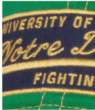
TWILL PATCH (TACP) THIS PROCESS METHOD UTILIZES A COMBINATION OF EMBROIDERY AND APPLIQUE FABRIC TO CREATE A GRAPHIC SEVERAL DIFFERENT FABRIC COLORS ARE AVAILABLE FOR USE. ONE APPLIQUE COLOR IS USED. SATIN STITCH TACK DOWN.