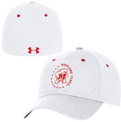
UNIVERSITY OF MARYLAND UH208M000 AEU03784800 CAP FP RD, WH AEU03318307 CAP FCB RD