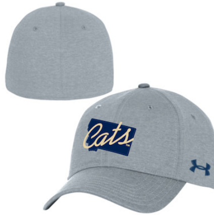
MONTANA STATE UNIVERSITY UH208M91TW AEU03784513 3DCTA FP A-UNYW, MNY, NGO AEU03318307 CAP CL MNY