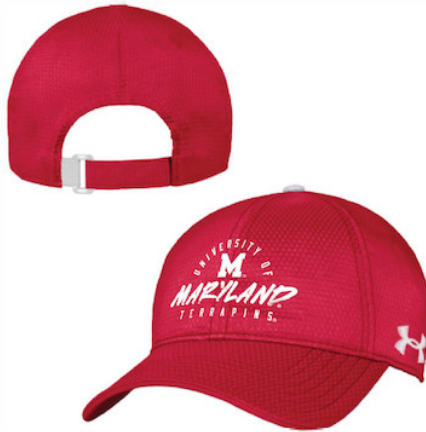
UNIVERSITY OF MARYLAND UH300W555 AEU03787336 CAP FP WH AEU03318307 CAP CL WH