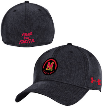
UNIVERSITY OF MARYLAND UH628M999 AEU03784831 PPACP FP WH, RD, PAR, BK AEU03784830 CAP FCB RD AEU03318307 CAP CL RD