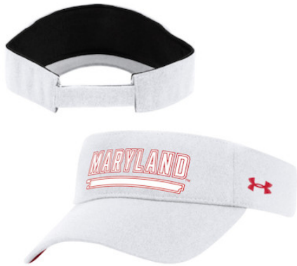
UNIVERSITY OF MARYLAND UH506M000 AEU03790235 CAP FP WH, RD AEU03318307 CAP CL RD