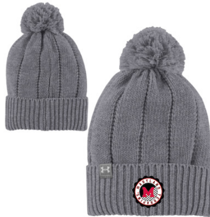
UNIVERSITY OF MARYLAND UH789W187H AEU03787249 PPACP FP RD, BK, WH