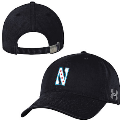
NORTHWESTERN UNIVERSITY UH800D999 AEU03779681 CAP FP WAT, RD, WH