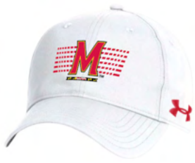
Performance 2.0 Adjustable Cap UH417M