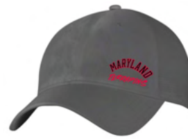
Mens ArmourVent™ Adjustable UH627M