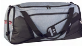
Undeniable MD Duffel UA1958