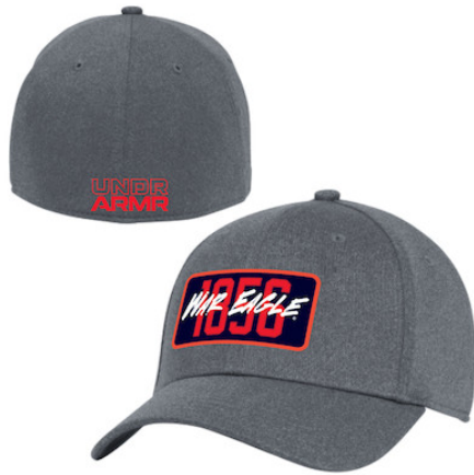
AUBURN UNIVERSITY UH503M917H AEU03787308 PPACP FP RO, MNY, WH, RU AEU03332964 CAP FCB RO