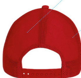
SNAP BACK CLOSURE