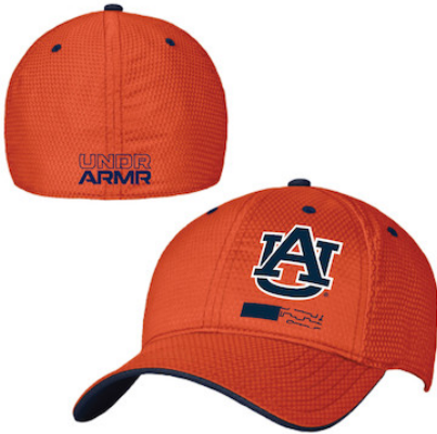
AUBURN UNIVERSITY UH310M455 AEU03790225 3DCP FPL MNY, WH AEU03332964 CAP FCB MNY