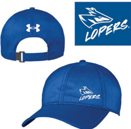
UNIVERSITY OF NEBRASKA AT KEARNEY UH300W148 AEU03787183 CAP LLP WH, RNY AEU03318307 CAP CB WH