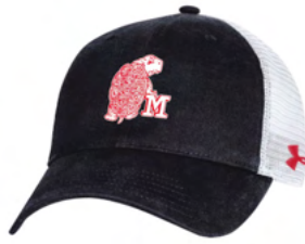
Mens Garment Washed Cotton Trucker Adj. UH801M