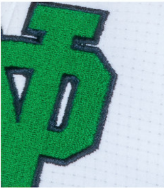
FLAT EMBROIDERY (CAP) PLAIN EMBROIDERY WITHOUT DIMENSION OR ADDITIONAL MATERIAL