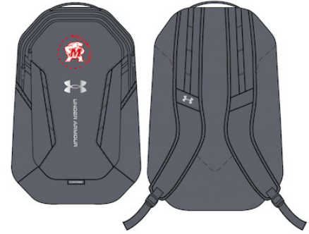
UNIVERSITY OF MARYLAND UA05289171 AEU03784798 E F RD, WH