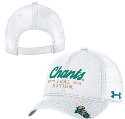
COASTAL CAROLINA UNIVERSITY UH300Y000 AEU03784941 3DCP FP FG, GTN AEU03140630 CAP CBL FG, GTN, BK, WH AEU03318307 CAP CL FG