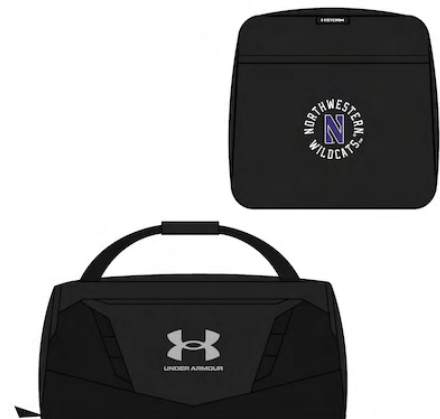
NORTHWESTERN UNIVERSITY UA1958999 AEU03787276 E F DP, WH