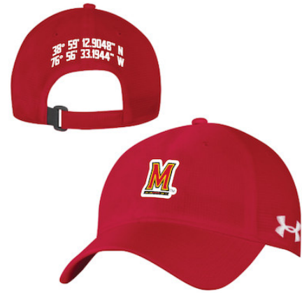
UNIVERSITY OF MARYLAND UH627M555 AEU03773024 TACP FP A-UWHC, RD, BK, PAR, WH AEU03169955 CAP CA WH AEU03318307 CAP CL WH