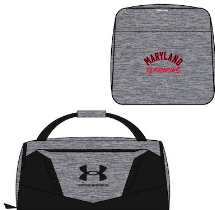
UNIVERSITY OF MARYLAND UA1958917H AEU03784795 E F RD, BK