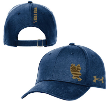
AUBURN UNIVERSITY UH504W19H AEU03790624 LACAP LLP A-LET, CC AEU03790625 CAP VBT CC AEU03318307 CAP CL CC