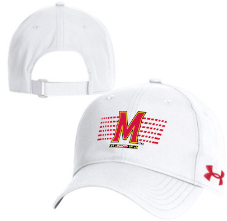
UNIVERSITY OF MARYLAND UH417M000 AEU03785875 CAP FP WH, BK, RD, PAR AEU03318307 CAP CL RD