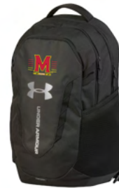
Hustle 6.0 Backpack UA0528