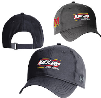
UNIVERSITY OF MARYLAND UH417D999 AEU03787217 CAP FP2 RD, WH, BK, PAR