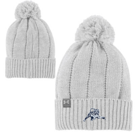
AUBURN UNIVERSITY UH789W900H AEU03670630 CAP FP CSS, MNY