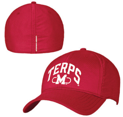
UNIVERSITY OF MARYLAND UH310M555 AEU03787257 3DCP FP WH AEU03332971 CAP VBT WH