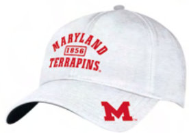
Youth Armour Adjustable UH206Y