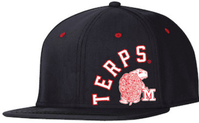
UNIVERSITY OF MARYLAND UH551M999 AEU03787343 3DCP FPL RD, WH AEU03332964 CAP FCB RD