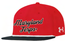
Mens Huddle UH551M