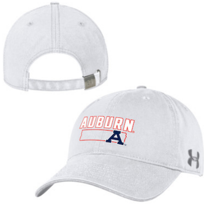
AUBURN UNIVERSITY UH800D000 AEU03787193 CAP FP RO, MNY, WH