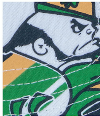
SCREEN PRINT (PC1) SCREEN PRINT - ONE COLOR ALLOWED ON HUDDLE AND COTTON TWILL FABRIC.