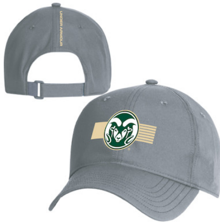
COLORADO STATE UNIVERSITY UH417M972 AEU03795785 CAP FP WH, NGO, DG AEU03332971 CAP VBT NGO