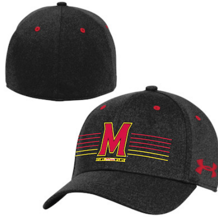
UNIVERSITY OF MARYLAND UH503M99H AEU03782362 3DCP FP RD, WH, BK, PAR AEU03318307 CAP CL RD