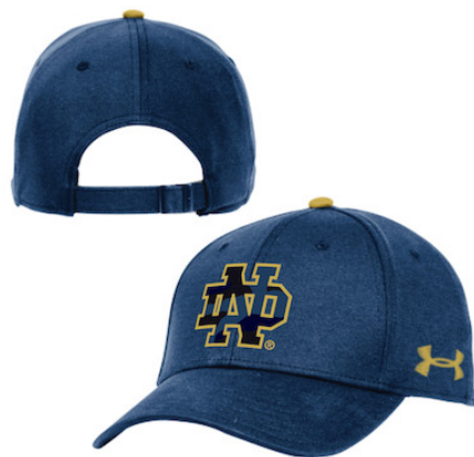
UNIVERSITY OF NOTRE DAME UH504M19H AEU03790631 TACP FP A-UNCC, GDR AEU03318307 CAP CL GDR