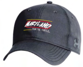
Domestic Performance 2.0 Adjustable Cap UH417D