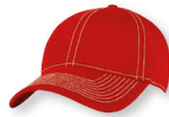
CONTRAST TOP STITCHING