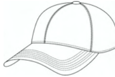
Womens Garment Washed Cotton Adjustable UH80OW