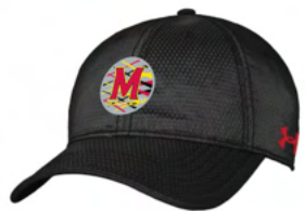
Mens Zone Adjustable UH300M