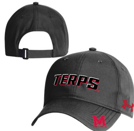
UNIVERSITY OF MARYLAND UH417M999 AEU03674072 CAP FP WH, RD, BK AEU03180200 CAP CBL RD, BK AEU03318307 CAP CL RD