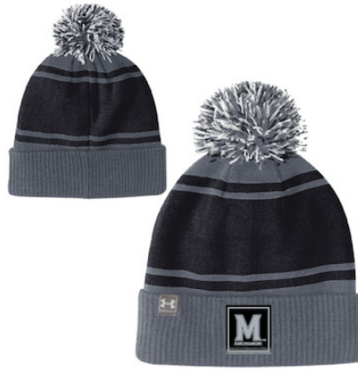
UNIVERSITY OF MARYLAND UH706U9500 AEU03790627 PACP FP TG, BK