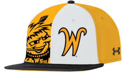
WICHITA STATE UNIVERSITY UH551M000 AEU03319489 3DCP FPL MYW, BK APU03792585 NZCP1 FPR MYW, BK AEU03318307 CAP CL BK