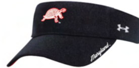
Blitzing 3.0 Visor UH506M