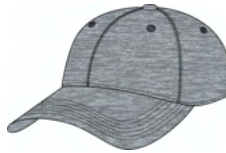
Mens Armour Adjustable UH209M