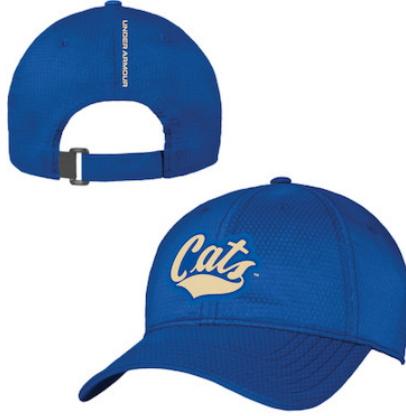
MONTANA STATE UNIVERSITY UH300M148 AEU03759095 3DCTA FP A-URYC, NGO, TBL AEU03332971 CAP VBT NGO