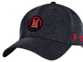
Mens ArmourVent™ Stretch Fit UH628M