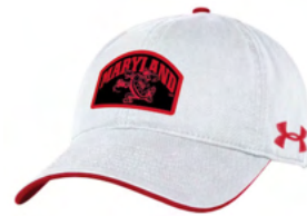
Womens Garment Washed Cotton Adj. UH800W