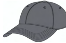
Youth Zone Adjustable UH300Y