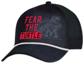
Mens Twist Armour 3.0 Trucker Snapback UH916M