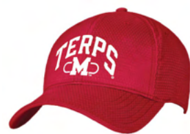
Mens Zone Stretch Fit UH310M