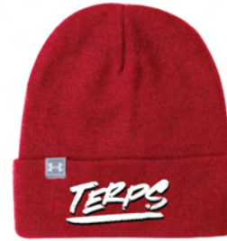
Halftime Beanie UH707U