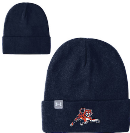
AUBURN UNIVERSITY UH707U190 AEU03779688 CAP FP RO, MNY, WH