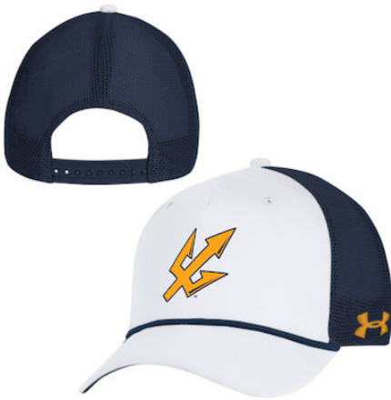
University of California, San Diego UH916M019 AEU03770506 3DCP FP MNY, MYW AEU03318307 CAP CL MYW