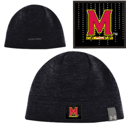
UNIVERSITY OF MARYLAND UH775U999 AEU03787253 PACP FP RD, WH, BK, PAR