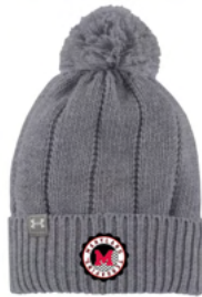
Womens Everyday POM Beanie UH789W