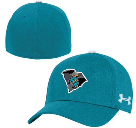
COASTAL CAROLINA UNIVERSITY UH503M219 AEU03787316 TACP FP A-UBCC, BK, CDK, WH, HNT AEU03318307 CAP CL WH