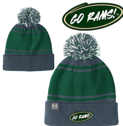
COLORADO STATE UNIVERSITY UH706Y292 AEU03787242 PTACP FP A-UFGC, NGO, WH