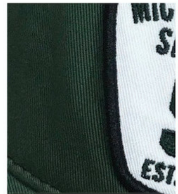
3D TWILL PATCH (3DCTA) 3D ELEMENTS INCORPORATED ONTO TWILL OR WOOL PATCH. MAY BE FULL LOGO OR PATCH SHAPE. 3D TACKDOWN CAN BE OPTIONAL.