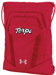
Undeniable Sackpack UA1957