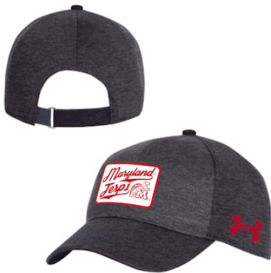
UNIVERSITY OF MARYLAND UH209W99TW AEU03784755 TACP FP A-UWHW, RD, WH