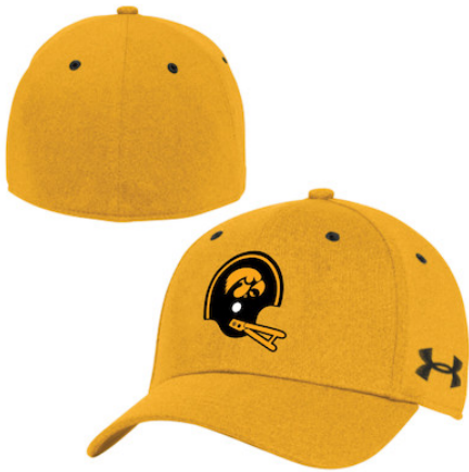
The University of Iowa UH503M307 AEU03755369 CAP FP WH, MYW, BK AEU03318307 CAP CL BK