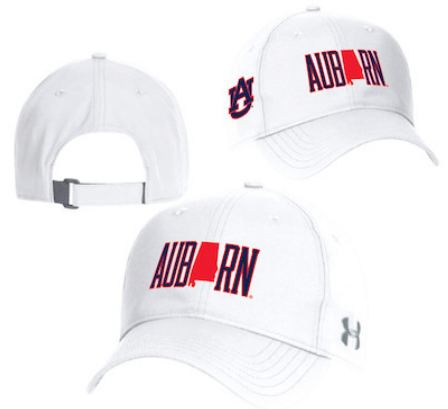
AUBURN UNIVERSITY UH417D000 AEU03790213 CAP FP2 MNY, RO