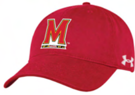
Mens Garment Washed Cotton Adj. UH800M