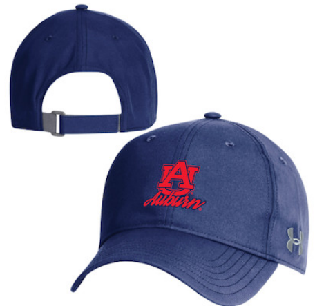
AUBURN UNIVERSITY UH417D1090 AEU03787197 CAP FP MNY, RO