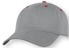
CONTRAST BUTTON & EYELETS