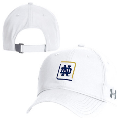
UNIVERSITY OF NOTRE DAME UH417D000 AEU03786163 CAP FP MNY, GDR