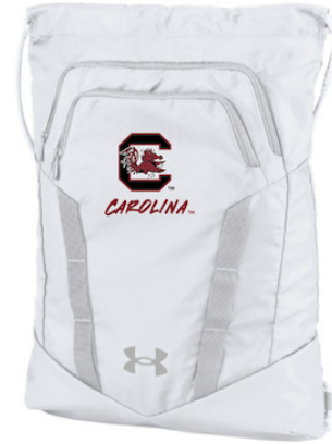
UNIVERSITY OF SOUTH CAROLINA UA1957000 AEU03787262 E F MA, BK, WH