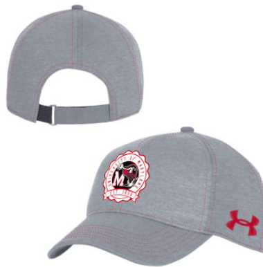
UNIVERSITY OF MARYLAND UH209W91TW AEU03790622 TACP FP A-UWHW, BK, RD, WH AEU03318307 CAP CL RD