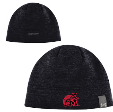
UNIVERSITY OF MARYLAND UH775U999 AEU03782347 CAP FP RD, BK