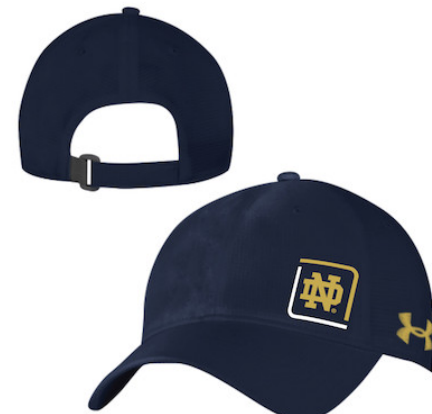
UNIVERSITY OF NOTRE DAME UH627M190 AEU03786163 CAP LLP GDR, WH AEU03318307 CAP CL GDR