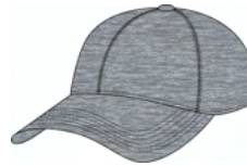
Womens Armour Adjustable UH209W