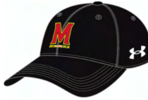
Structured OTS Cap UH415M