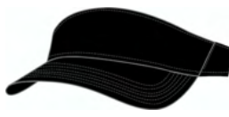
Blitzing 3.0 Visor UH506M