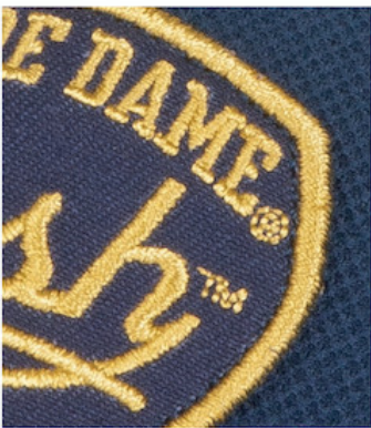
MERROWED EDGE PATCH (PTACP) TWILL PATCH WITH A MERROWED (RAISED EDGE)