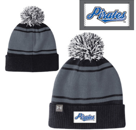
SETON HALL UNIVERSITY UH706U999 AEU03787284 PACP FP WH, BK, TBL