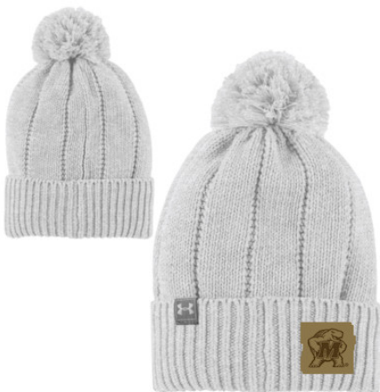
UNIVERSITY OF MARYLAND UH789W900H AEU03790626 LACAP FPL A-LET, CC