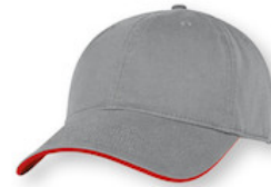
CONTRAST VISOR ROLL