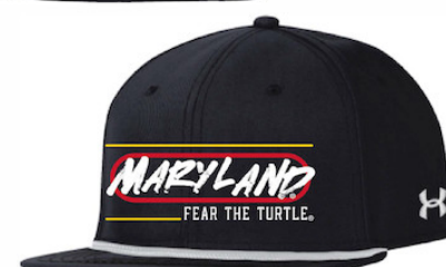
UNIVERSITY OF MARYLAND UH551M999 AEU03792606 3DCP FP RD, PAR, WH AEU03318307 CAP CL WH