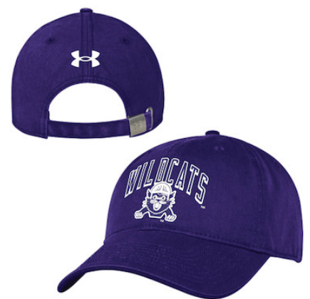
NORTHWESTERN UNIVERSITY UH800M630 AEU03787334 CAP FP WH, DP AEU03318307 CAP CB WH