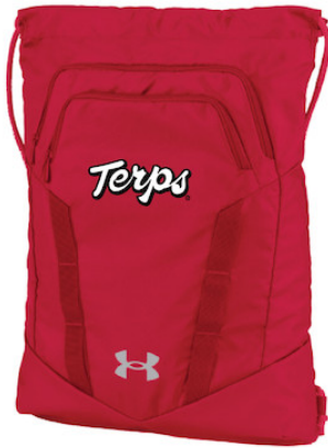
UNIVERSITY OF MARYLAND UA1957555 AEU03771336 E F WH, BK