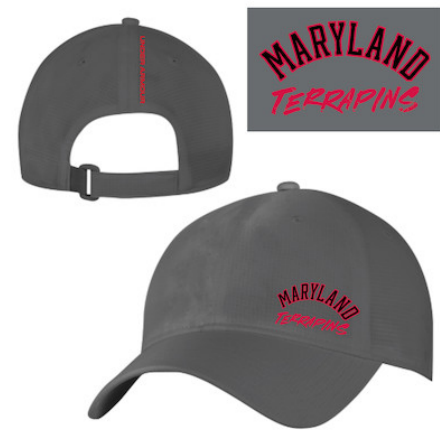
UNIVERSITY OF MARYLAND UH627M972 AEU03784791 CAP LLP RD, BK AEU03332971 CAP VBT RD