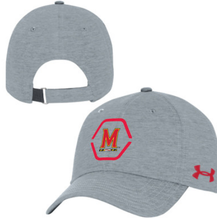
UNIVERSITY OF MARYLAND UH209M91TW AEU03782361 3DCP FP RD, PAR, WH, BK AEU03318307 CAP CL RD