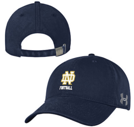
UNIVERSITY OF NOTRE DAME UH800D190 AEU03728501 CAP FP WH, GDR