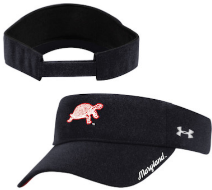
UNIVERSITY OF MARYLAND UH506M999 AEU03782436 PACP FP WH, RD AEU03782437 CAP VEL WH AEU03318307 CAP CL WH