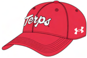
Unstructured OTS Cap UH414M