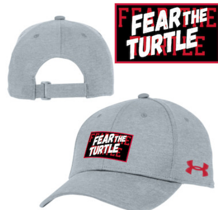
UNIVERSITY OF MARYLAND UH504Y91H AEU03787223 PACP FP RD, BK, WH AEU03318307 CAP CL RD