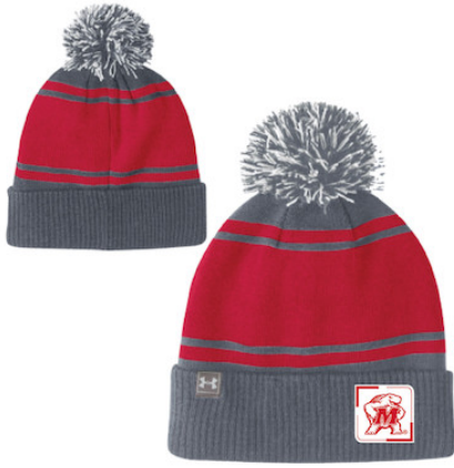
UNIVERSITY OF MARYLAND UH706U9500 AEU03787254 PACP FPL WH, RD