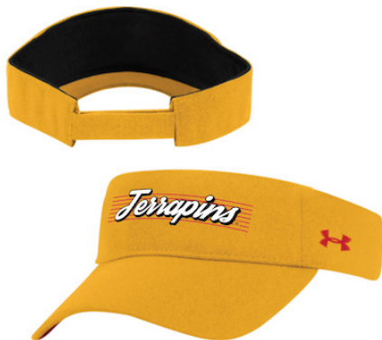
UNIVERSITY OF MARYLAND UH506M307 AEU03784777 CAP FP WH, RD, BK AEU03318307 CAP CL RD