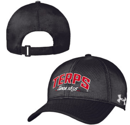
UNIVERSITY OF MARYLAND UH300W999 AEU03790623 CAP FP WH, RD AEU03318307 CAP CL WH