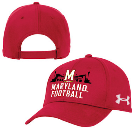
UNIVERSITY OF MARYLAND UH504M555 AEU03792870 CAP FP WH, RD, PAR, BK AEU03318307 CAP CL WH