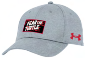
Youth Blitzing 3.0 Adjustable UH504Y