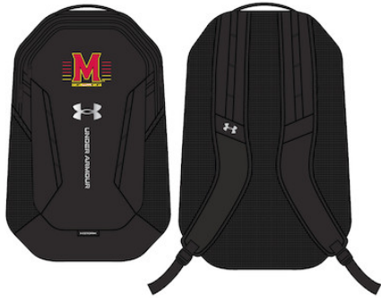
UNIVERSITY OF MARYLAND UA0528999 AEU03782340 E F RD, WH, BK, PAR