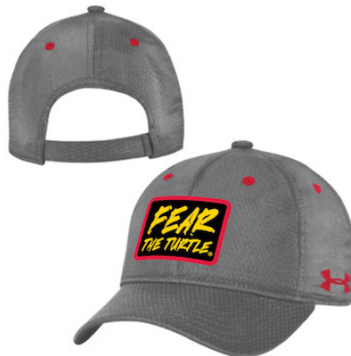
UNIVERSITY OF MARYLAND UH300Y972 AEU03787335 3DCTA FP A-UBKW, RD, PAR AEU03318307 CAP CL RD