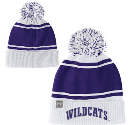
NORTHWESTERN UNIVERSITY UH706Y000 AEU03784508 3DCP FP DP, TG