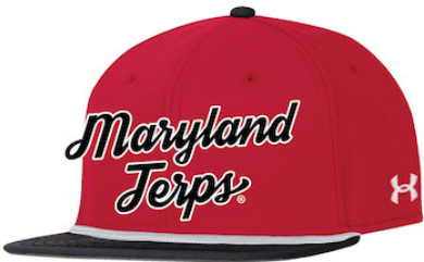
UNIVERSITY OF MARYLAND UH551M555 AEU03791499 3DCP FP WH, BK AEU02657293 CAP FCB WH AEU03318307 CAP CL WH