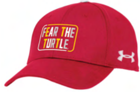
Womens Blitzing 3.0 Adjustable UH504W