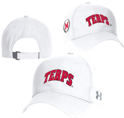
UNIVERSITY OF MARYLAND UH417D000 AEU03782338 CAP FP2 RD, BK