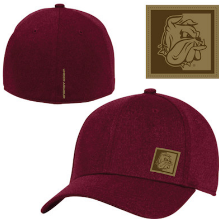
UNIVERSITY OF MINNESOTA DULUTH UH503M580 AEU03761063 LACAP LLP A-LET, CC AEU03332971 CAP VBT CC