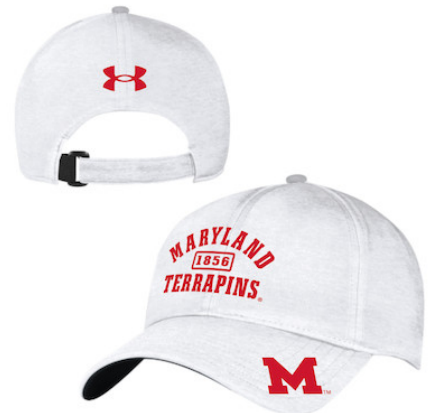
UNIVERSITY OF MARYLAND UH206Y000 AEU03784937 CAP FP RD AEU03805606 CAP CBL RD AEU03318307 CAP CB RD