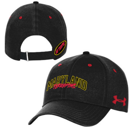
UNIVERSITY OF MARYLAND UH209M999 AEU03790218 CAP FP RD, BK, PAR AEU03318307 CAP CL RD AEU03790220 PACP CRB RD, BK, PAR