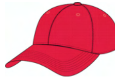
Womens Blitzing 3.0 Adjustable UH504W