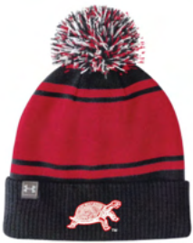
Youth POM Beanie UH706Y