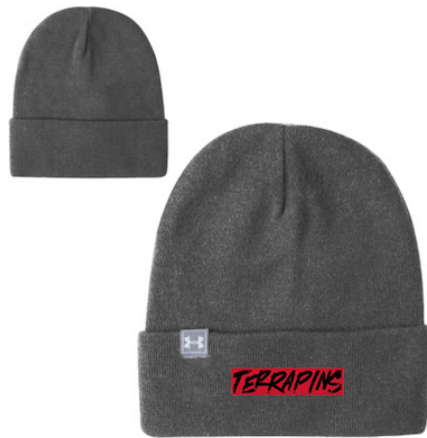
UNIVERSITY OF MARYLAND UH707U972 AEU03787281 PACP FP RD, BK