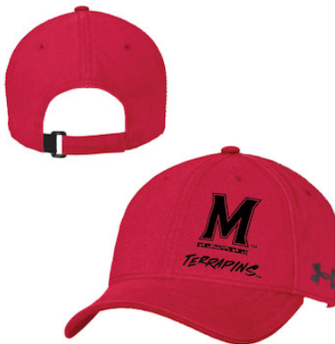
UNIVERSITY OF MARYLAND UH800Y555 AEU03784932 CAP FPL RD, BK AEU03318307 CAP CL BK