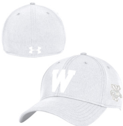
UNIVERSITY OF WISCONSIN MADISON UH628M000 AEU03449162 TACP FP A-UWHW, WH AEU03483182 CAP CL DS, WH AEU03318307 CAP FCB WH