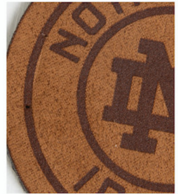
LEATHER PATCH (LACP) FAUX LEATHER PATCH WITH LASER PRINTED LOGO/DESIGN. LIMIT 1 COLOR. WILL HAVE A BEAN STITCH TACKDOWN. OPEN TO CIRCULAR AND RECTANGULAR SHAPES AS WELL AS CUSTOM SHAPES.