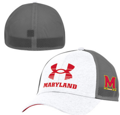
UNIVERSITY OF MARYLAND UH505M000 AEU03792599 CAP FP RD AEU03722367 CAP CL RD, PAR, WH, BK