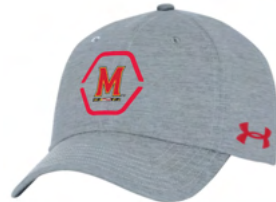
Mens Armour Adjustable UH209M