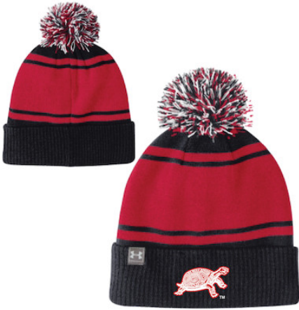
UNIVERSITY OF MARYLAND UH706Y999 AEU03782344 TACP FP A-UWHW, RD, WH