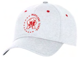
Mens Armour Cap Stretch Fit UH208M