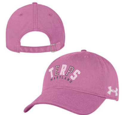
UNIVERSITY OF MARYLAND UH800W5111 AEU03784828 CAP FP CH, CMB, WH AEU03318307 CAP CL WH