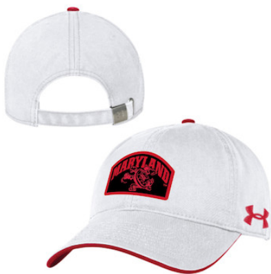
UNIVERSITY OF MARYLAND UH800W000 AEU03782364 TACP FP A-UBKW, RD AEU03318307 CAP CL RD