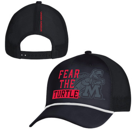
UNIVERSITY OF MARYLAND UH916M99BB AEU03782440 3DCP FP RD, BK APU03782367 PC1 EFF CH AEU03332971 CAP VBT RD