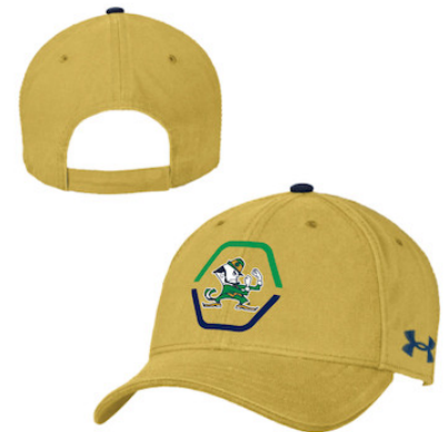
UNIVERSITY OF NOTRE DAME UH800Y394 AEU03790217 3DCP FP MNY, GR, WH, GDR AEU03318307 CAP CL MNY