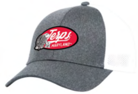
Mens Blitzing 3.0 Spacer Mesh Stretch Fit UH505M