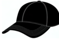
Womens Zone Adjustable UH300W