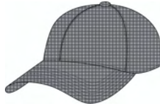
Mens ArmourVent™ Adjustable UH627M