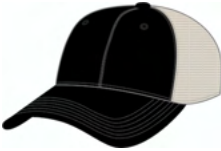
Mens Garment Washed Cotton Trucker Adjustable UH80IM