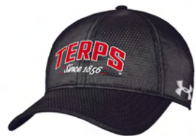
Womens Zone Adjustable UH300W