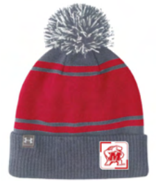
POM Beanie UH706U