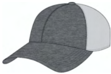
Mens Blitzing 3.0 Spacer Mesh Stretch Fit UH505M