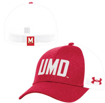
UNIVERSITY OF MARYLAND UH505M555 AEU03784785 3DCP FP WH AEU03782439 PACP FCB WH, BK, RD, PAR AEU03318307 CAP CL RD