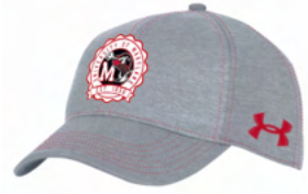
Womens Armour Adjustable UH209W