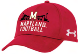
Mens Blitzing 3.0 Adjustable UH504M