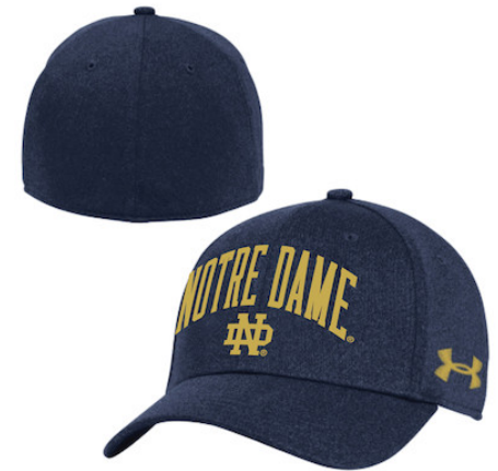
UNIVERSITY OF NOTRE DAME UH503M190 AEU03787315 3DCP FP GDR AEU03318307 CAP CL GDR